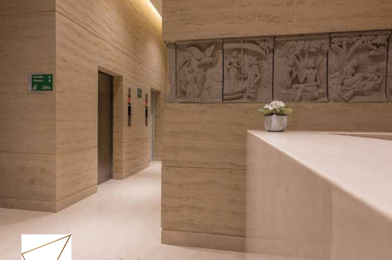
Aroha in Borivali East draws inspiration from nearby Buddhist cave carvings; photo courtesy of Pentaspace.