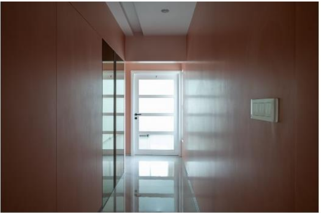
Connective corridors link the waiting rooms to the other OPD cabins like the paediatric and sonography units.

To retain the open spatial feel, give both doctors their personal space, and separate the patients as they move in, the cabins have been relegated to two corners on opposite ends of the waiting room. Connective corridors link the waiting rooms to the other OPD cabins like the paediatric and sonography units.