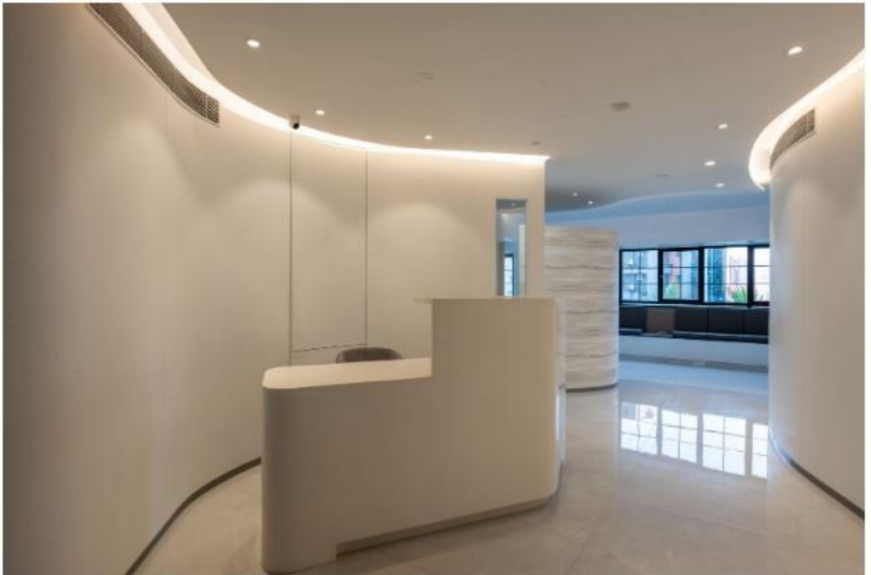
Two curved walls encase the reception area, one representing the curve of the spine and the other of the womb.

Situated in a commercial building in the bustling suburbs of Mumbai, this clinic is an extension of another similar space on a lower floor of the same building. Stripped down to its bare bones, this 2,000 sq ft area had to be assembled sectionally while some parts of the space continued to be used for medical procedures.