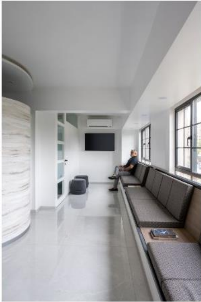
The space fans out into a horizontal waiting room with light spilling in through the wide windows, where visitors can comfortably idle away their waiting time.