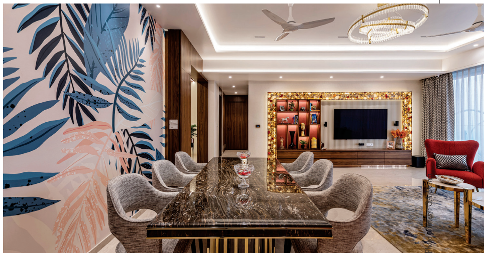
The smart home standard 'Matter' will enable devices designed by different tech companies in a seamless manner.

In a timeline when energy efficiency is being taken seriously, smart homes become an even more enticing prospect, says Kunal Khandelwal, Partner, Studio Design . "From solar panels and electric charging stations to smart thermostats and resource optimisation systems, smart homes look like the next step to sustainable living. The possibilities are endless when we have air-conditioners that can turn off when no one is in the room or the fact that we can operate our home systems through our phones, no matter where we are. Sensors can adjust temperature and humidity and remind us to water our plants or make an important call. Security surveillance