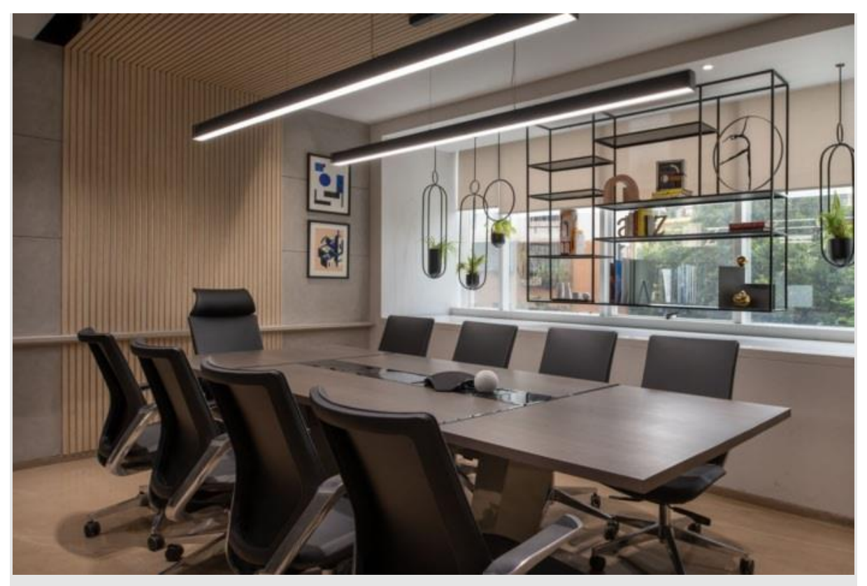
THE OFFICE SNAPSHOTS WEEKLY NEWSLETTER

A weekly digest of the latest office designs delivered every Monday (<u>view sample</u>)